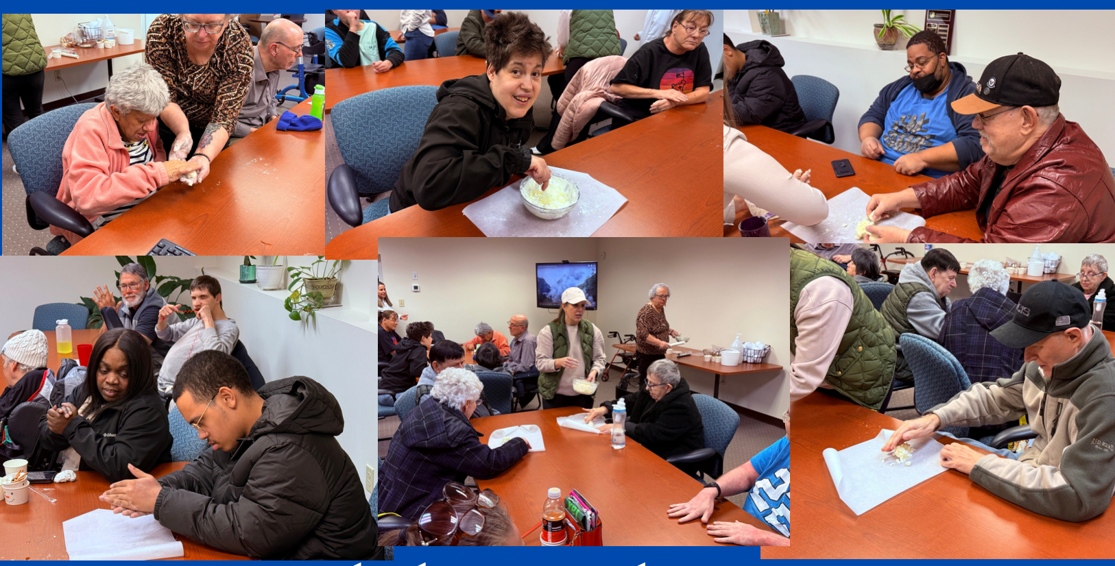
Out and About In The Community