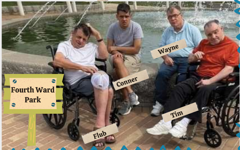
Fourth Ward Park